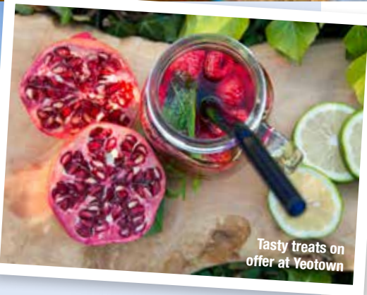
Tasty treats on offer at Yeotown