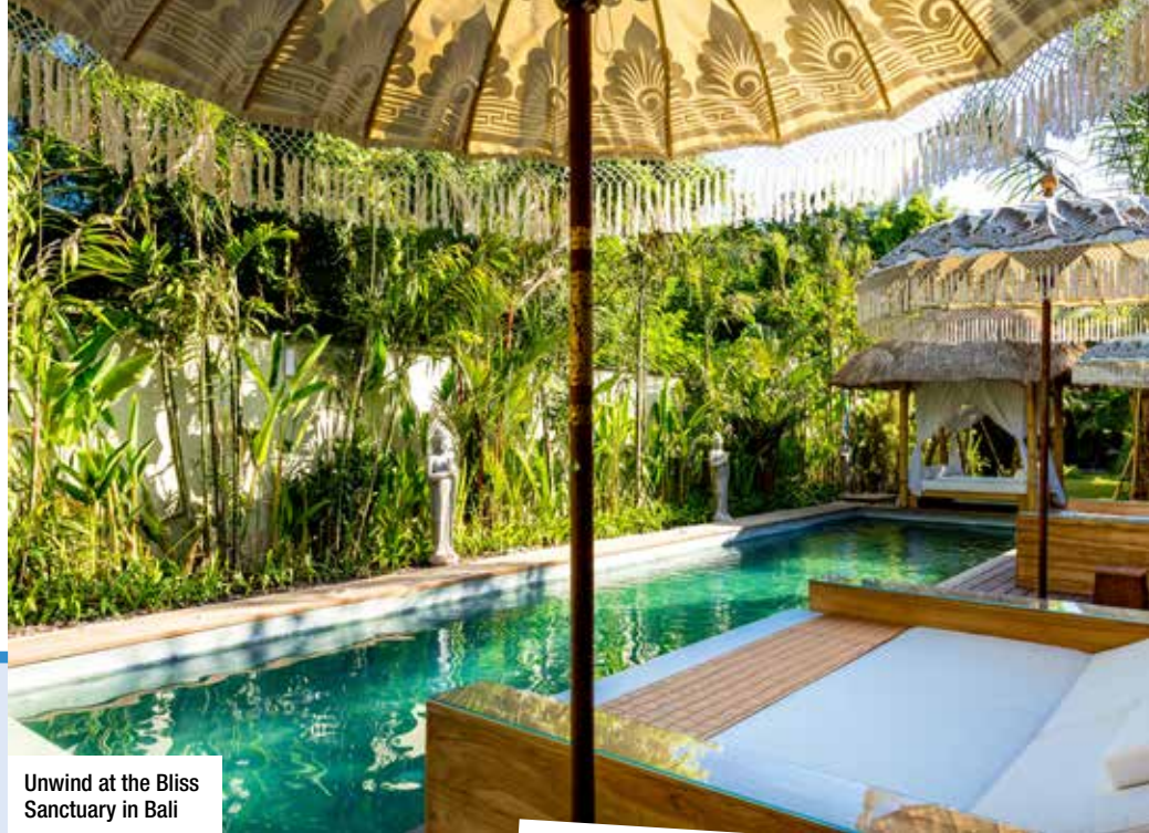
Unwind at the Bliss Sanctuary in Bali

One of London's most popular yoga studios, Stretching The City at London's Angel, runs retreats across the south of England. Head to Brooklands Barn in Arundel, West Sussex, which has a yoga studio with heated floor, and an indoor pool. Numbers are capped at 15 to allow for individual instruction. From £349pp for 2 nights. See stretchingthecity.com