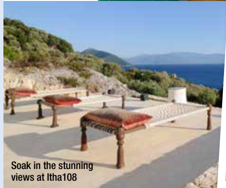
Soak in the stunning views at Itha108