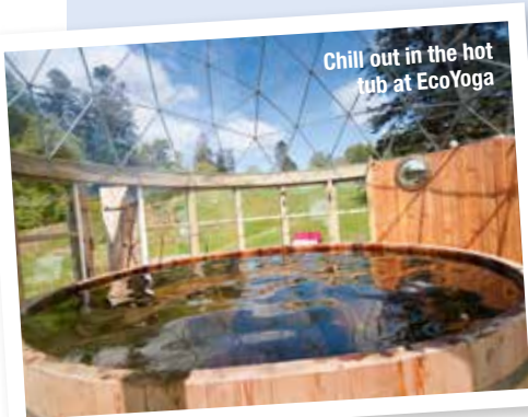
Chill out in the hot tub at EcoYoga

Head to Bali and the villa-based Bliss Sanctuary For Women . Stressed out businesswoman Zoë Watson wanted to create a relaxing space where women would feel comfortable on their own, but it's also the ideal place to visit with friends. Your hostess helps you plan a perfect week from a menu of yoga classes, in-room treatments and sightseeing trips. From £1,680, excluding flights. See blissanctuaryforwomen.com