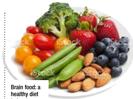
Brain food: a healthy diet helps, too

Other types of yoga are also good for your brain - significant improvements in working memory were found in a group of 55 to 79 year olds who practised Hatha yoga and meditation three times a week for eight weeks, compared with a group that